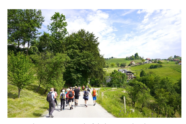
Pilgrimage in wonderful Slovenian landscape

The path from Pilštajn Square leads us past farms and meadows through the village of Klake, where we first admire the larger chapel of Mary, Help of Christians by the roadside and then, at the next crossroads, the chapel of Our Lady of the Scapular. We descend on the old forest road to the cluster village Ortnice. Then the path leads us along the Buča stream