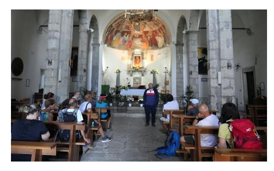
Experiencing churches spiritually, © Ernst Leitner