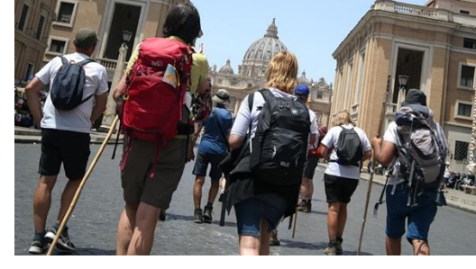
International arrival © Ernst Leitner